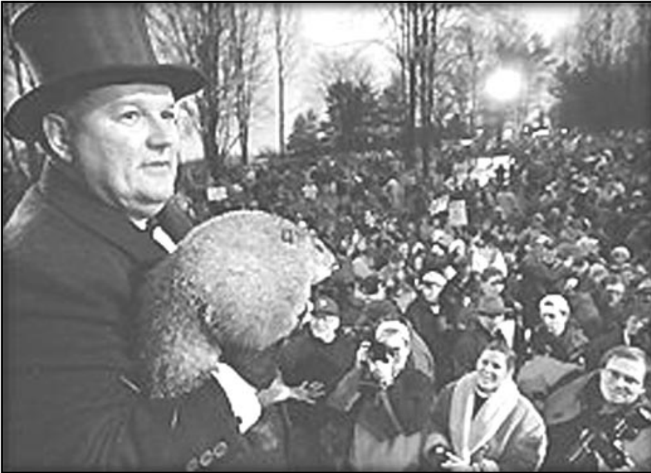
Yes, Buford Bill looks amazingly like Punxsutawney Phil.