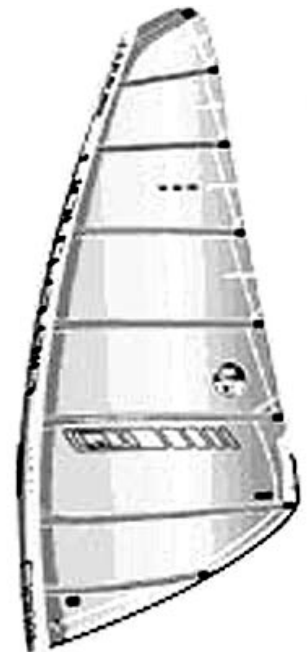
North Race Sail: 1999 IQ

batten and skinnied it up a bit and then, you'd NEVER be able to tell the difference. Except on the water, of course. Of course.